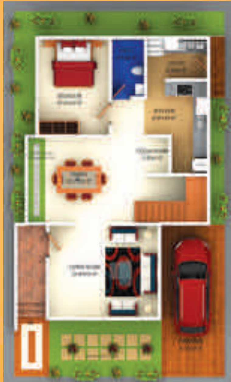
GROUND FLOOR PLAN 30X50 WEST VILLAS @ CELEBRITY SERENITY