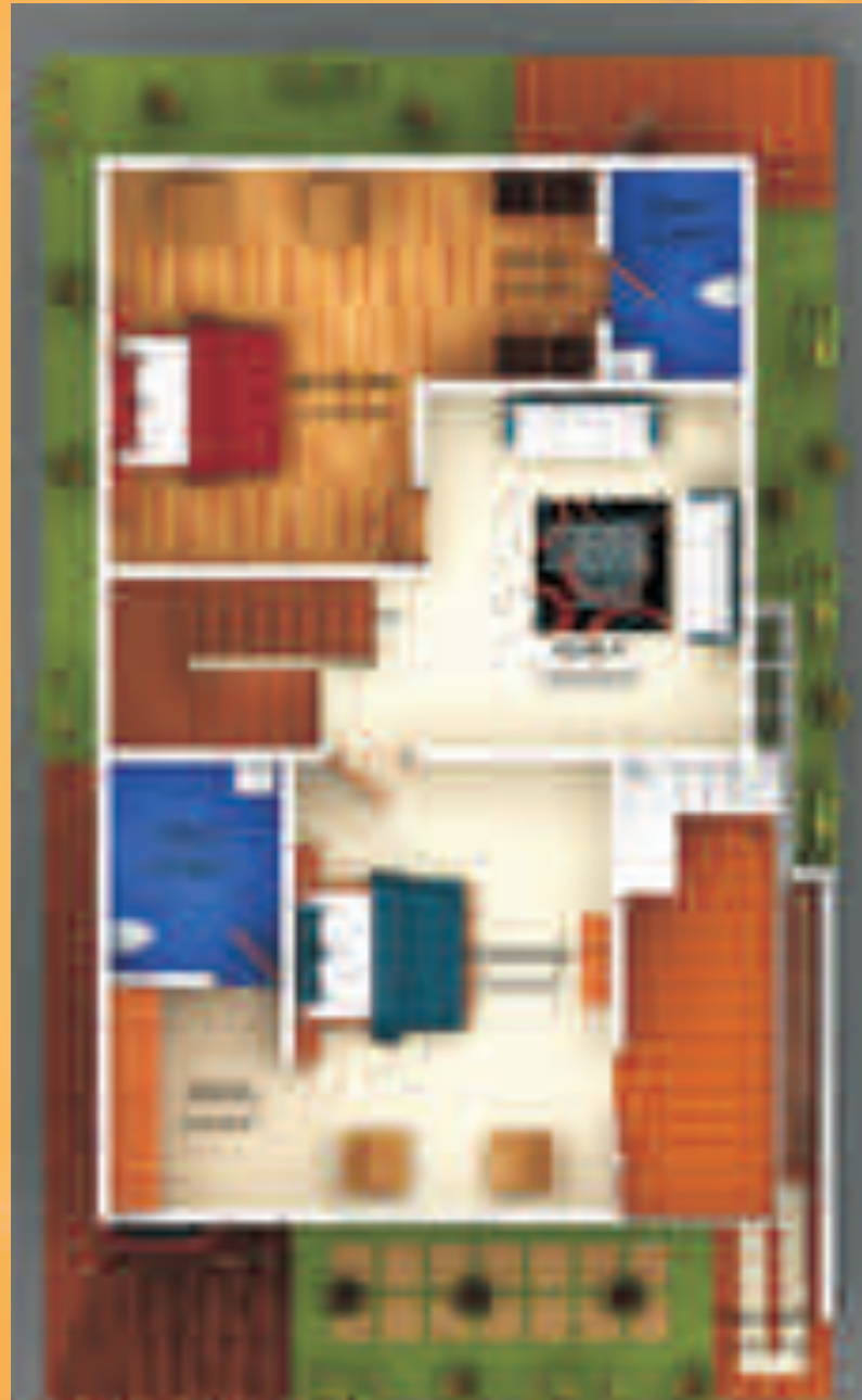
GROUND FLOOR PLAN 30X50 EAST VILLAS @ CELEBRITY SERENITY